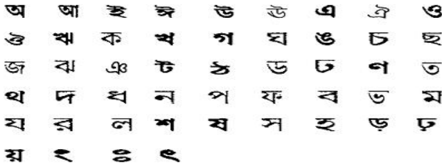
Figure 3. Bengali Script Characters