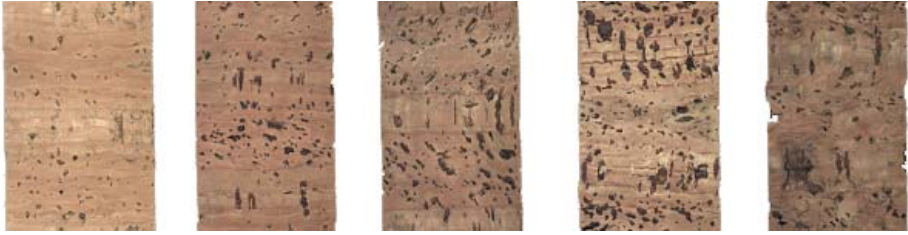
Fig. 2. Surfaces of cork stoppers of 5 quality groups ordered from best to worst quality (from left to right).